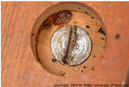
Under a recessed nightstand screw

Bed bugs seek narrow harborage places for which their flat body shapes are designed. They normally reside close to their "hosts", but can hide over 20 feet away and crawl that distance to feed if necessary--particularly in severe infestations. A "stale sweet" odor may be detected in severe or long-lasting infestations.