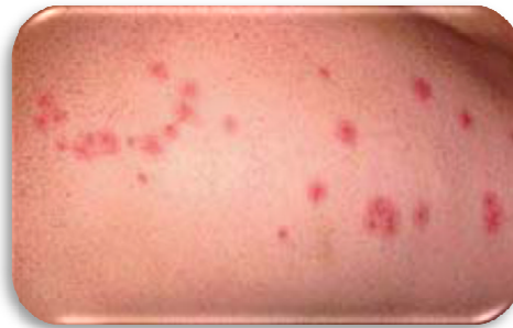
Typical Bed Bug Bites

Both male and female bed bugs bite and ingest blood. The blood meals are necessary for the female to reproduce and the juveniles to develop. The bites themselves are normally painless, and the host typically is not disturbed while bed bugs feed. While responses differ, within a day of the bite(s), most people then experience itching, pain, and/or swelling of the skin where the bed bug bite occurred. This is most common on the arms, face, hands, back or other exposed areas. Bed bugs are drawn to body warmth and carbon dioxide from our respiration. You will usually see 3 or 4 bites in a line or grouped together.