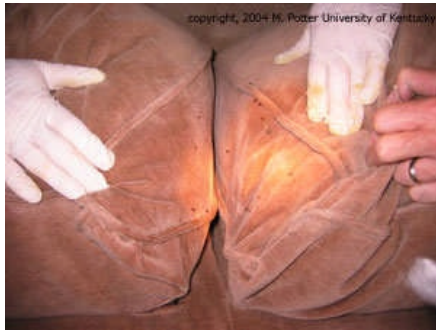
Bed bugs infesting a couch

Bed bugs seek narrow harborage places for which their flat body shapes are designed. They normally reside close to their "hosts", but can hide over 20 feet away and crawl that distance to feed if necessary--particularly in severe infestations. A "stale sweet" odor may be detected in severe or long-lasting infestations.