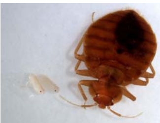
Bed bug eggs (left) and an adult bed bug (right)

home including kitchens, bathrooms and hallways. Bed bug infestations are not caused by poor sanitation. However, untidy, cluttered environments and failure to detect an infestation can cause the problem to become much worse over time.