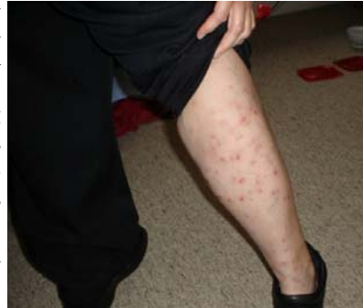
Bed bug bites

Bed bug bites appear in a variety of ways. Some bites take the form of a rash and become swollen while others do not. Because individuals gradually get bitten over the course of weeks and months, older bites tend to take on an appearance of scabbing. Both nymphs and adult bed bugs require blood. If a host is not present, bed bugs can survive for long periods without a blood meal. This varies with stage of growth—nymphs can survive without blood for a month whereas adults can survive for several months. Under optimal conditions bed bugs can complete a life cycle within two months.