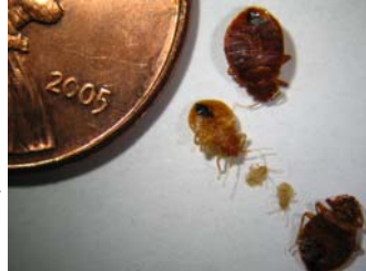
Adult and nymphal bed bugs

Bed bugs are nocturnal insects. Although they can be seen during the day, they generally feed at night. They commonly hide in the crevasses of furniture, picture frames, mattresses and other household items. Most bed bug infestations start at the point nearest a blood source—generally the bedroom. As infestations grow, bed bugs can eventually infest other areas of the