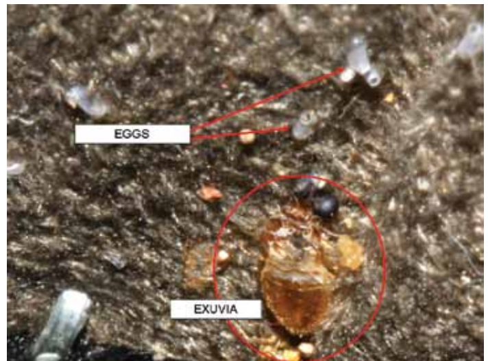
Figure 5. Bed bug indicators

the other carries body fluids from the host into the bug. Saliva may produce swelling and itching, and these areas may become infected when scratched.