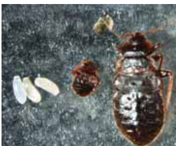
Figure 2. Eggs, nymph, and mature bed bug