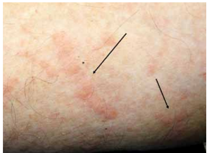
Figure 6. Bed bug bites

Both nymphs and adults typically feed at night but hide in nearby crevices and cracks during the day. Their small size and flattened bodies make it easy for them to hide in the seams of mattresses and box springs, cracks in bed frames and bedside tables, under loose wallpaper, behind wall hangings, and in other furniture. Although bed bugs do not live in nests or colonies, they do tend to congregate around good hiding places. These areas are usually evident because they are stained with dark red to blackish spots, which is dried bug excrement (Figure 4). There may also be eggs, eggshells, and the brownish molted skins (exuviae) of the maturing bugs (Figure 5).