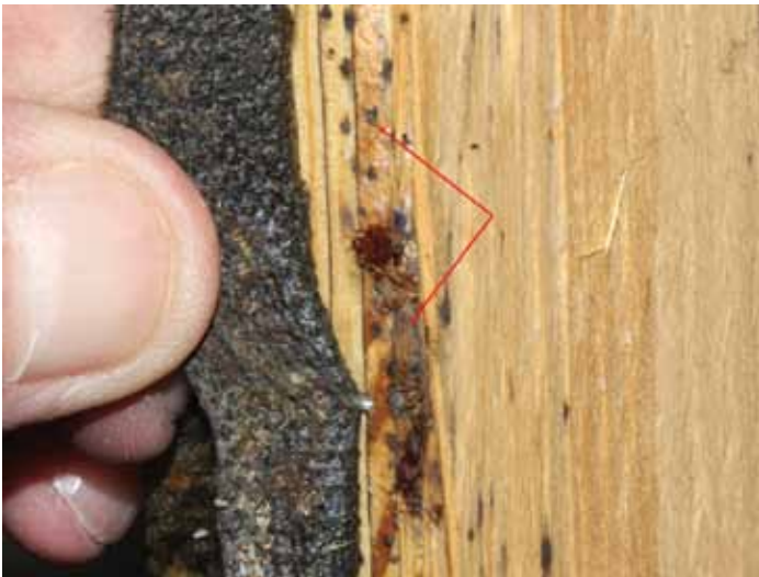
Figure 4. Dried bug excrement