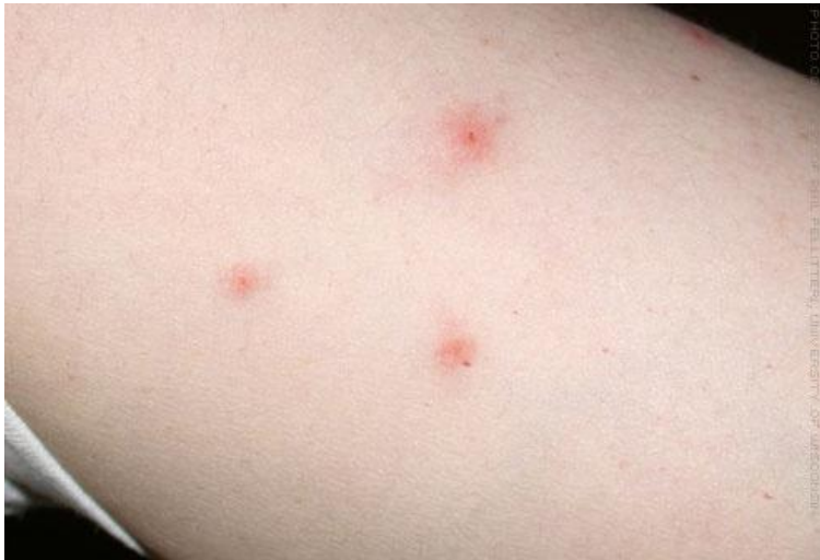
Simple reaction to bed bug bites