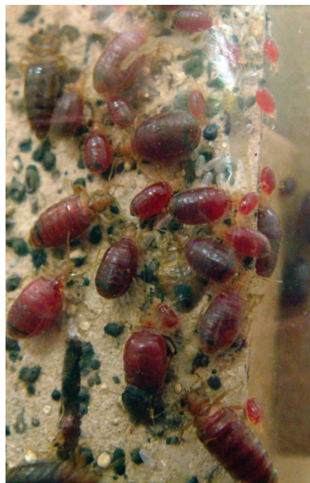
Fed bed bugs

The lifecycle data presented in this publication is based on research conducted using bed bugs collected from apartments within the state of Virginia. These populations have documented resistance to pyrethroid insecticides. Laboratory studies have indicated that resistant bed bugs have a shorter developmental time (several days), shorter life spans and lower levels of egg production than bed bugs that are not resistant to insecticides. At the time of this writing, practically all "natural" bed bug populations collected in Virginia have been found to be at least somewhat resistant to pyrethroid insecticides.