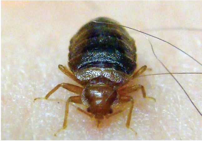
Bed bug feeding

when the human host is typically in their deepest sleep, that bed bugs like to feed.