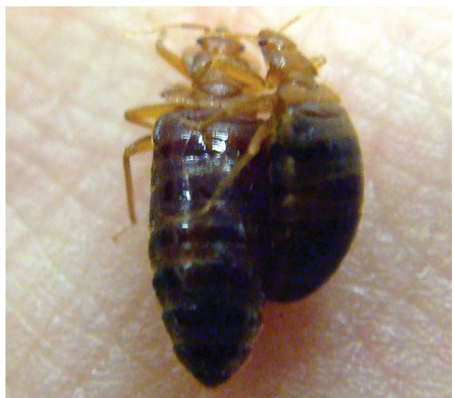
Bed bugs mating

In practical terms, this means that a single mated female brought into a home can cause an infestation without having a male present, as long as she has access to regular blood meals. The female will eventually run out of sperm, and will have to mate again to fertilize her eggs. However, she can easily mate with her own offspring after they become adults to continue the infestation.