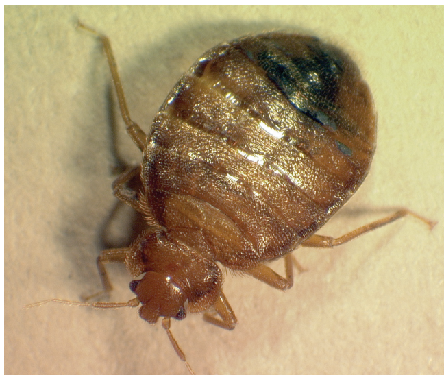
Unfed or starved adult bed bug

A recent laboratory study has shown that starvation can greatly reduce bed bug survival. This modern study