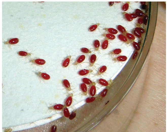
First instars after feeding

Even under the best conditions some bed bug nymphs will die prior to becoming adults. The first instars are particularly vulnerable. Newly hatched nymphs are