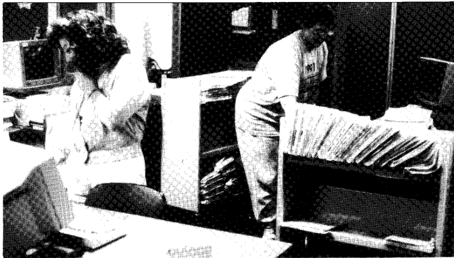
Figure 3. Irritation from paper fragments is especially common in offices and wherever files are stored.

increase levels of static electricity and the potential for problems from fragments or fibers. Static electricity may also cause body hair to move, giving the impression of insects crawling over the skin.